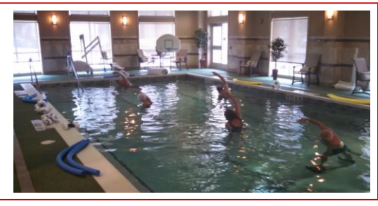
Water Aerobics Class at Passavant Community

Our professionally trained and certified team can help you set and achieve individual wellness goals. Become a member and gain access to our equipment, such as treadmills, recumbent bikes or steppers, which can improve your cardiovascular fitness or assist you to lose weight. If maintaining strength is important to you as you age, our team will provide one on one instruction for our specialized Keiser strength training machines. These machines are very smooth, hydraulic action and are easier on the joints than standard weight equipment. If you want to step it up another notch and be part of a class, you